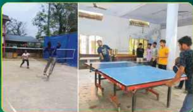
Students participating in indoor Games (Badminton and Table Tennis)