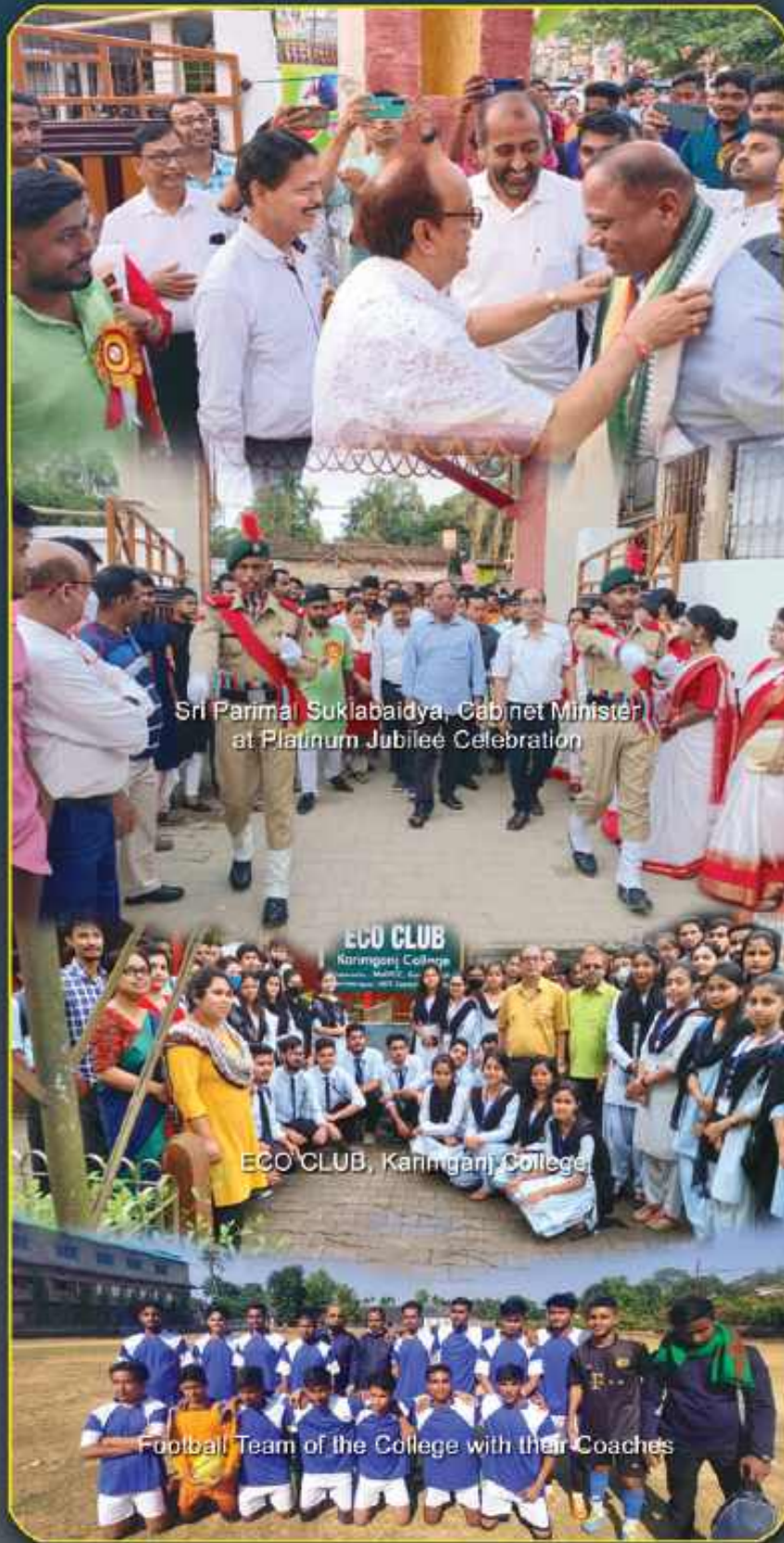
Sri Parimal Suklabaidya, Cabinet Minister at Platinum Jubilee Celebration