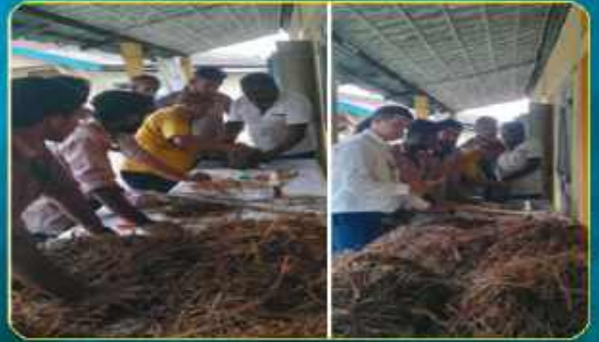
Hands on training on Mushroom Cultivation at R.K Nagar College. A collaborative vocational course between Karimganj College and R.K.Nagar College.