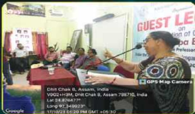
Guest Lecture in the Department of Philosophy