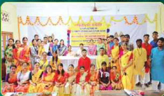
Program on Guest Lecturer of the Department of Sanskrit.