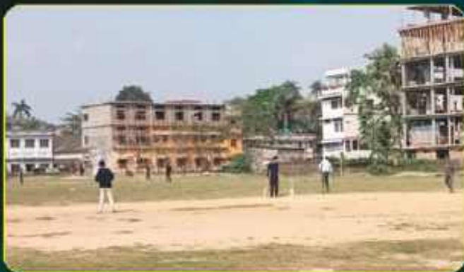
Cricket match between B.Com and B.Sc in Karimganj College Playground