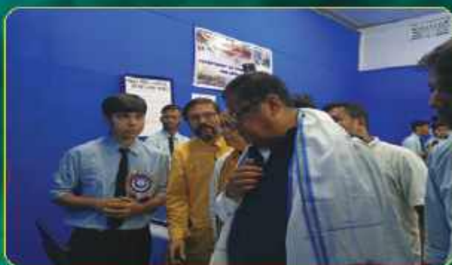
Students of Department of Computer Science & Application demonstrating their AI based Model in front of our Hon'ble Education Minister, Govt. of Assam in Karimganj College Platinum Jubilee Celebration