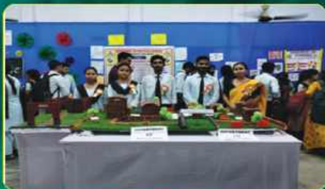
Student of History Department demonstrates the model of Khaspur, capital of Kachari Kingdom platinum Jubilee celebration, Karimganj college