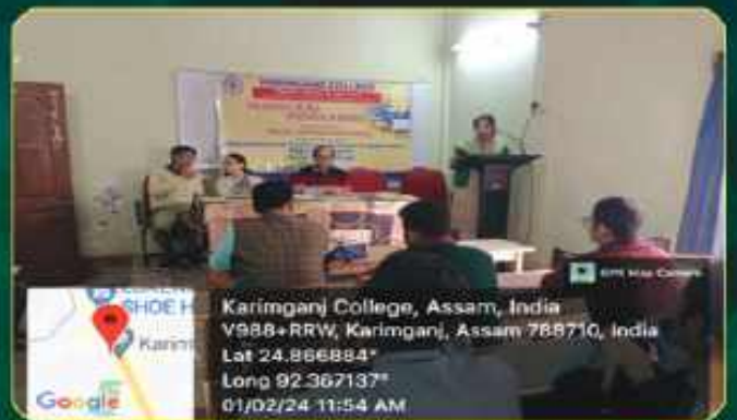
Inaugural Program of Digital Literacy Program of Certificate Course in Computer Skills conducted by Equal Opportunity Cell in association with Dept. of Computer Science & Application and Dept. of Physics, Karimganj College