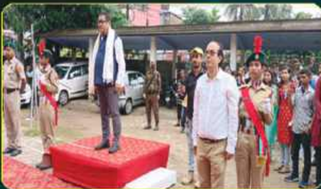
Honorable Education Minister is being given Guard of Honor by the cadets of NCC of the College on the Occasion of Final Phase of Platinum Jubilee Celebration of the College.