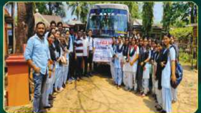
Students of the Department of Political Science are in a field trip/ survey on Electoral Politics to Latu..