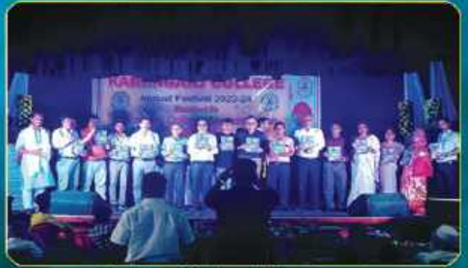
Unvailing of Platinum Jubilee Souvenir during College Annual Festival 2023-24