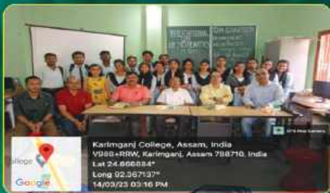
International Mathematics Day Celebration at Mathematics Department