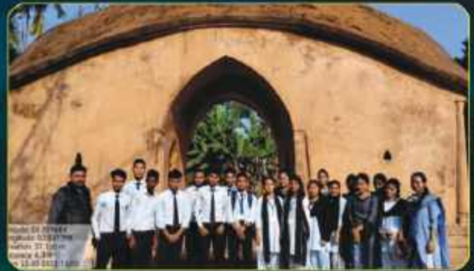
khaspur visit with students of History Department