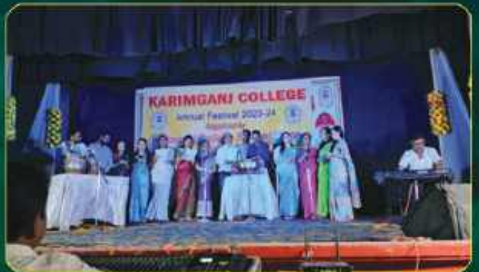
The Principal and Teachers are presenting group songs on the final day of the Annual Festival of the college