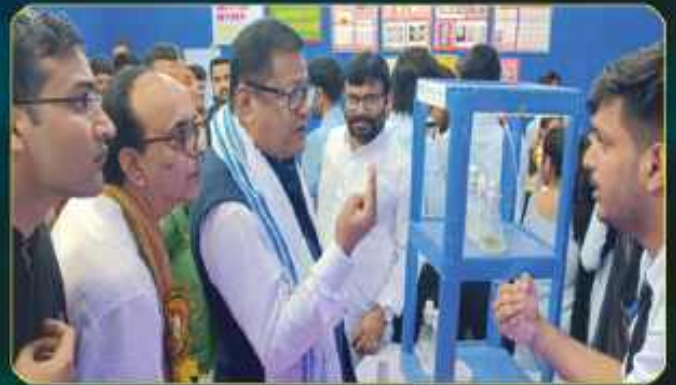
Honorable Education Minister is witnessing the exhibition during the final phase of Platinum Jubilee Celebration of the College. Students are demonstrating before the Honorable Education Minister.