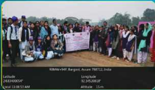
Awareness programme on the occasion of World wetlands day