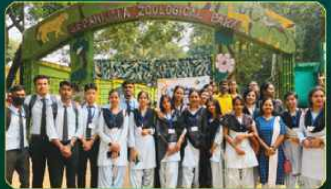
Zoological excursion at Sepahajala wild life Sanctuary, Agartala, Tripura