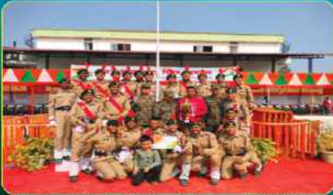
1st Prize in March -Past on 26 January (26/01/2024) organised by the District Administration Karimganj, NCC Cadets of Karimganj College