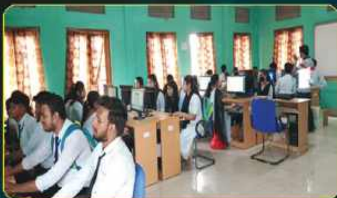
Classes going on in the Computer Lab, Dept. of Commerce