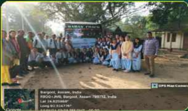
Department Survey (24-01-2024) Organised by Economics Department