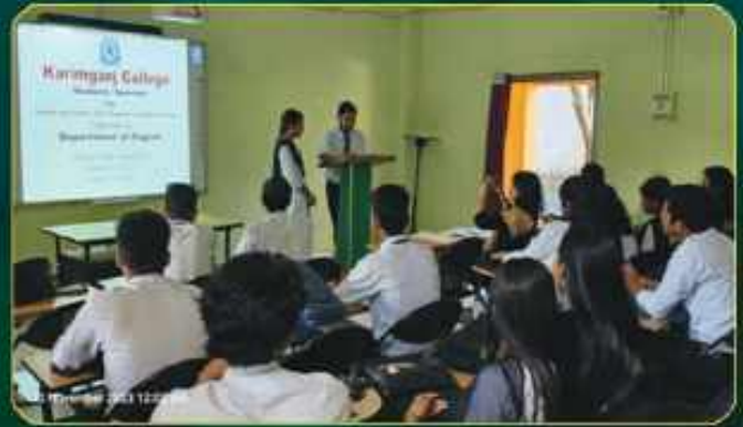
Student's Seminar, Department of English