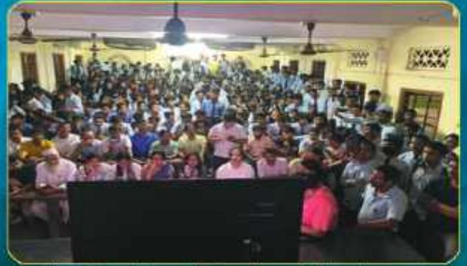
Live streaming of the landing of Chandrayan-3 on the surface of the Moon organised by Dept. of Physics on 23/08/2023