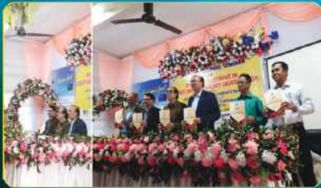
The inaugural session and the unveiling of the book on abstracts of papers contributed by the authors in the National Organized by the Department of Chemistry.