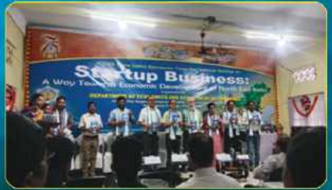
ICSSR Sponsored National Seminar (4-6 May 2023)