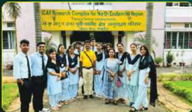
Zoological excursion at ICAR Agartala