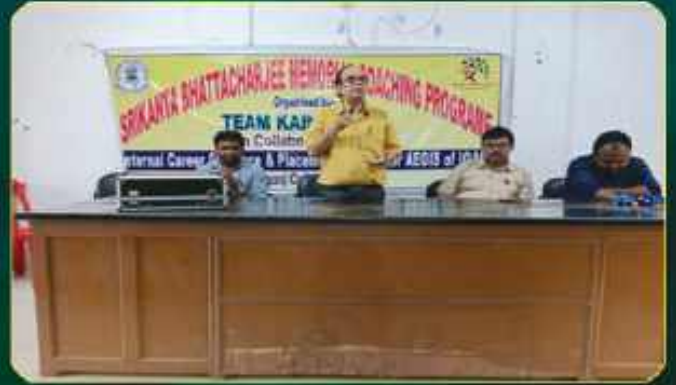
Coaching program for grade III & IV job. Organised by Team Karimganj and ICGPC Cell of Karimganj College