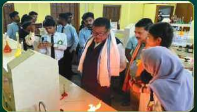
A model demonstrated by the Students of Chemistry Department in front Hon'ble Education Minister in the Chemistry Laboratory