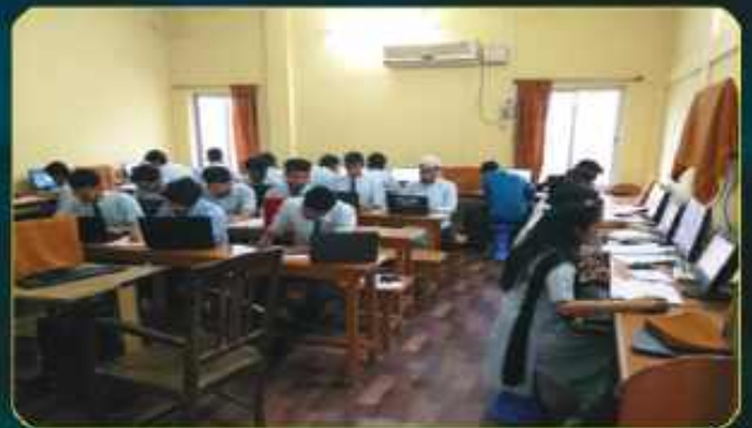
Lab classes going on in Computer Science Department