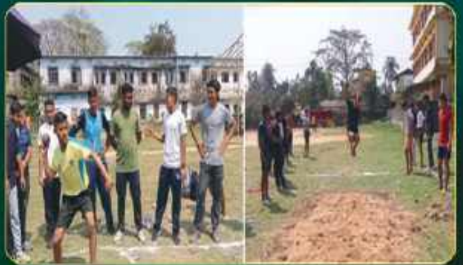
Students participating in Outdoor Games (Athletic events)