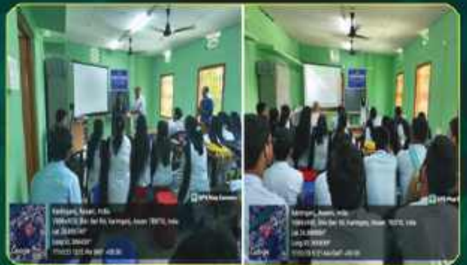
Student Seminar organized by Dept. of Mathematics