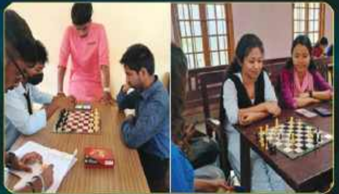
Chess Competition between students