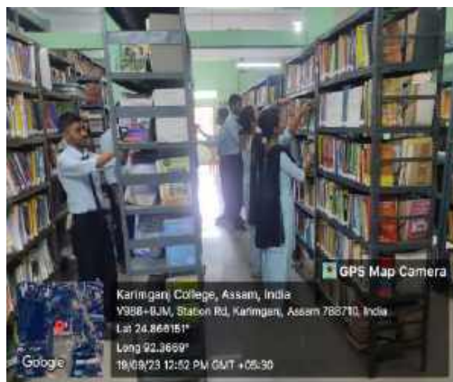
Reading room and Bookshelf of Central Library