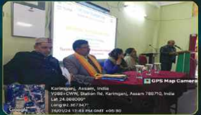
National Tourism Day 2024 :: Programme of YUVA Tourism Club in collaboration of Dept. of History