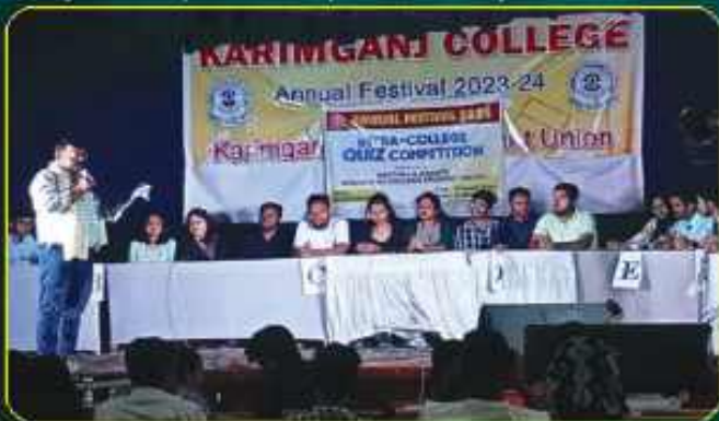
Intra College Quiz Competition during Annual Festival 2023-2024